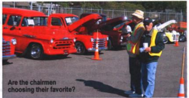
Are the chairmen choosing their favorite?