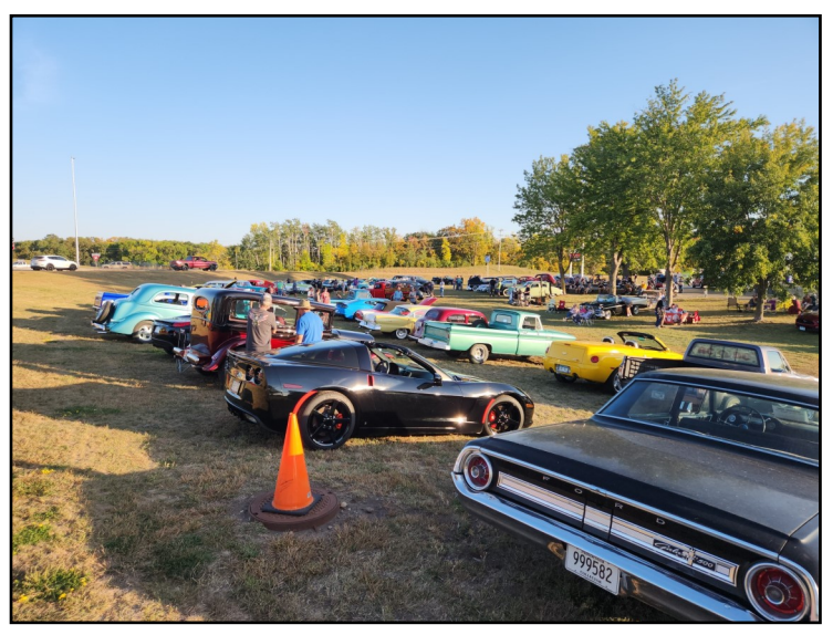
A&W Night in New London