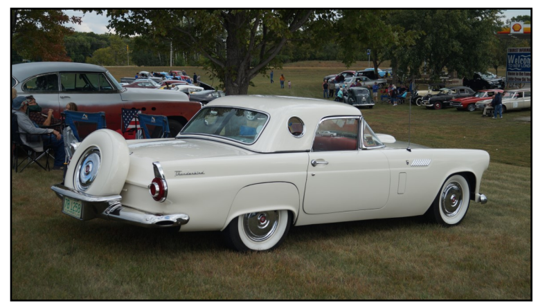
A&W Night in New London