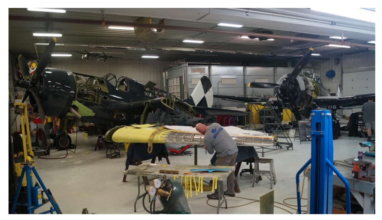
From the overlook, we were able to observe the restoration of an aircraft in progress. This aircraft has been under reconstruction for 12 years. They are currently working on the wings.